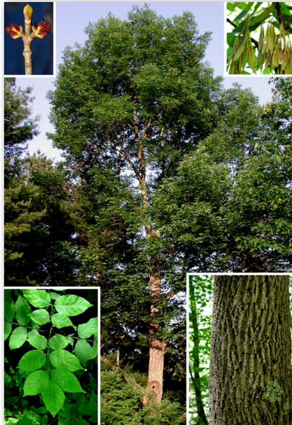
Example page from Summer White Ash

“I spent time looking at your wonderful CD. Its SO MUCH MORE than I expected it to be! I couldn’t get over its overall appearance and had to get a neighboring teacher to come look at it. She thought it was outstanding, too. We thought the photos and text informative without being over-whelming. The diagrams and arrows pointing out certain details described were so helpful to someone wanting to understand a plant. What a fantastic job! I do so want to spend more time with the CD. So many of the plants you mention grow in this area and I’ve never found a source to tell me what they all are. I hope to share it with our high school biology instructor soon and see what he thinks of the CD. This CD would be a great asset to a middle school, high school, or college instructor and student when teaching/studying botany. Its a portable resource easily taken into the field or elsewhere. The photos are so clear in different stages of growth and angles that it enables one to readily identify a plant.” — Jan Johnson , Elementary School Teacher, Wakefield, NB.